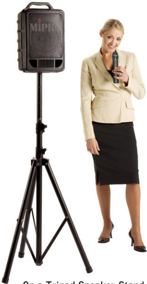
On a Tripod Speaker Stand