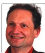
Arnoud Arntz Keynote: Schema Therapy for Personality Disorders Workshop: Schema Therapy for Borderline Personality Disorder