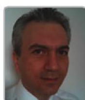
Costas Papageorgiou Keynote: The Role of Metacognition in Rumination and Depression Workshop: Metacognitive Therapy for Depression