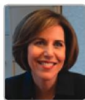
Judith Beck Keynote: CBT for Personality Disorders Workshop: A Cognitive Behavioral Program for Weight Loss and Maintenance