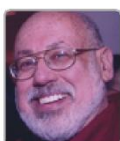
Arthur Freeman Keynote: CBT in Work Performance and Satisfaction Workshop: Treating Personality Disorder Across the Lifespan