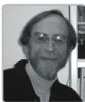
Tom Borkovec Keynote: Reflections on Four Decades as a Behavior Therapist Workshop: Integrative Cognitive Behavioural, Interpersonal, and Experiential Therapy for Generalized Anxiety Disorder