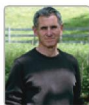
Jon Kabat-Zinn Keynote: Mindfulness in Medicine and Psychology - Lessons from the Past and Challenges for the Future Workshop: Mindfulness in Medicine and Psychology - A First-Hand Taste and Clinical Applications