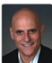
Steven Hayes Keynote: What a Contextual Behavioral Approach has to Contribute to Cognitive Therapy Workshop: An Introduction to Acceptance and Commitment Therapy