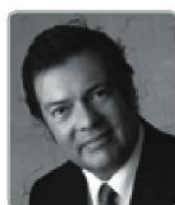
Douglas Turkington Keynote: Cognitive Therapy for Patients with Psychosis Who Refuse Antipsychotic Medication Workshop: Cognitive Therapy for Patients with Psychosis Who Refuse Antipsychotic Medication