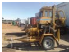
↑. NEW AUGER RIG

CALL MURRAY NOW to find out how we can efficiently and cost effectively manage your exploration project.