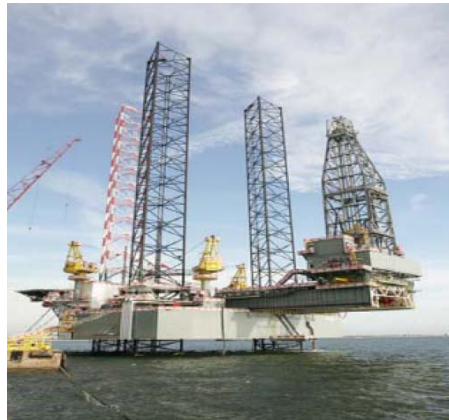
Seadrill's West Atlas Jackup Rig to drill Wisteria 1