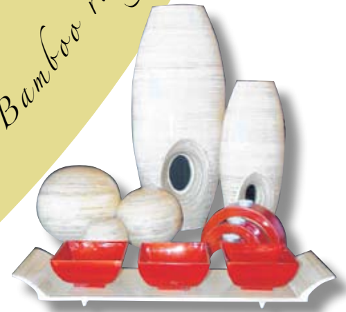
■ Chapels on Whatley