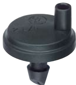
Agri Drip™ Standard Emitter

Horticultural tree and row crops, vineyards and landscape applications.