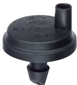
Agri Drip™ Pressure Compensating Emitter