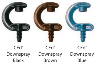
CFd® Downspray Black