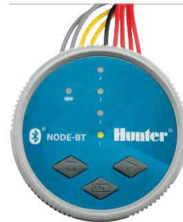
NODE-BT Diameter: 8.9 cm Height: 8.3 cm

The Bluetooth® word mark and logos are registered trademarks owned by Bluetooth SIG Inc. and any use of such marks by Hunter Industries is under license. iOS is a trademark or registered trademark of Cisco in the U.S. and other countries and is used under license. Android is a trademark of Google LLC.