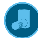
Freeze-Clik Sensor Page 152