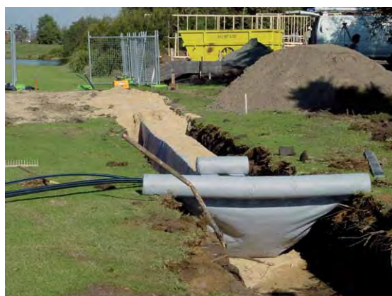
VersiTank® Infiltration System used in a trench application