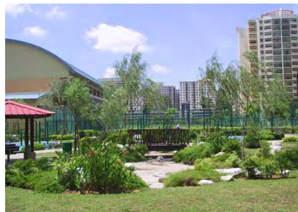
VersiTank® Infiltration System and the completed 'Rain Garden'