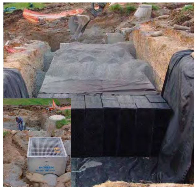
VersiTank® Infiltration System being installed

VersiTank® units may be enveloped in an impervious membrane to allow for the retention or temporary storage of stormwater, where soil conditions do not permit discharge into the surrounding soil. Stored water is released via a connected stormwater pipe incorporating a flow control valve, or re-used, subject to local environmental regulations.