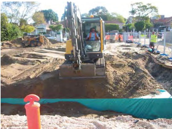
VersiTank® Infiltration System installed under a car parking area