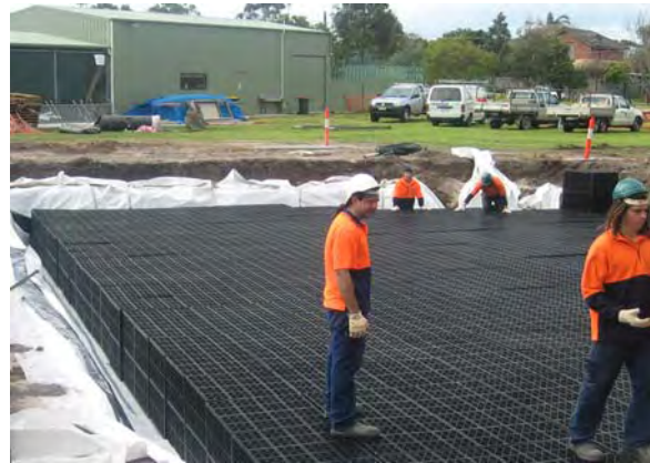
VersiTank® modules allow storm water to be stored and re-used for irrigation