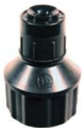
Spectrum™ Thread 1/2"