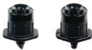
Spectrum™ Barb 4 mm