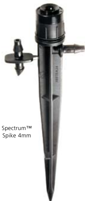
Spectrum™ Spike 4mm