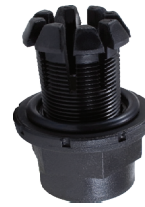
BARBED TANK FITTING