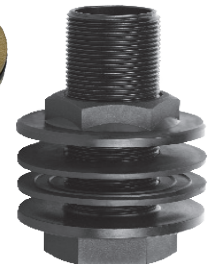
LARGE TANK FITTING