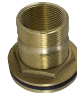
BRASS TANK FITTING