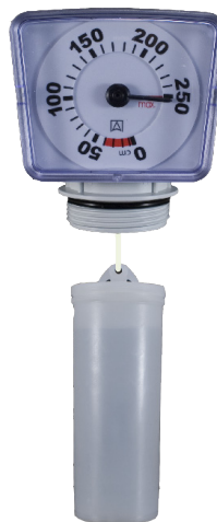
TANK LEVEL GAUGE