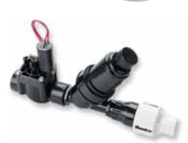
The PCZ101 is a pre-assembled kit that brings together the PGV valve with both a filter and a pressure regulator, providing you with a complete control zone for drip applications.

Charts based on full-open flow control position