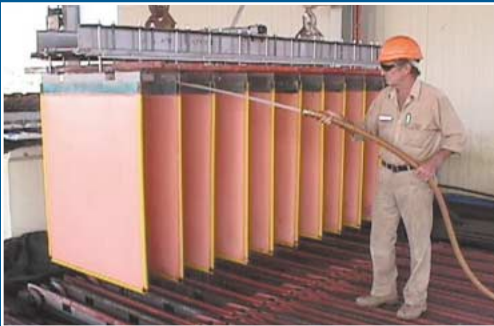
Finished copper cathode ready for stripping.