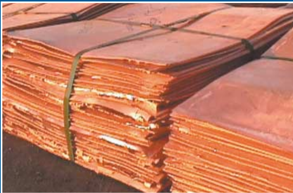
Copper cathode produced by Matrix in September 2000.