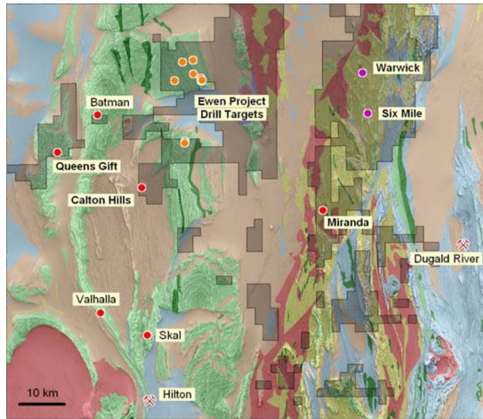
Figure 2. Mt Isa North Anomalies