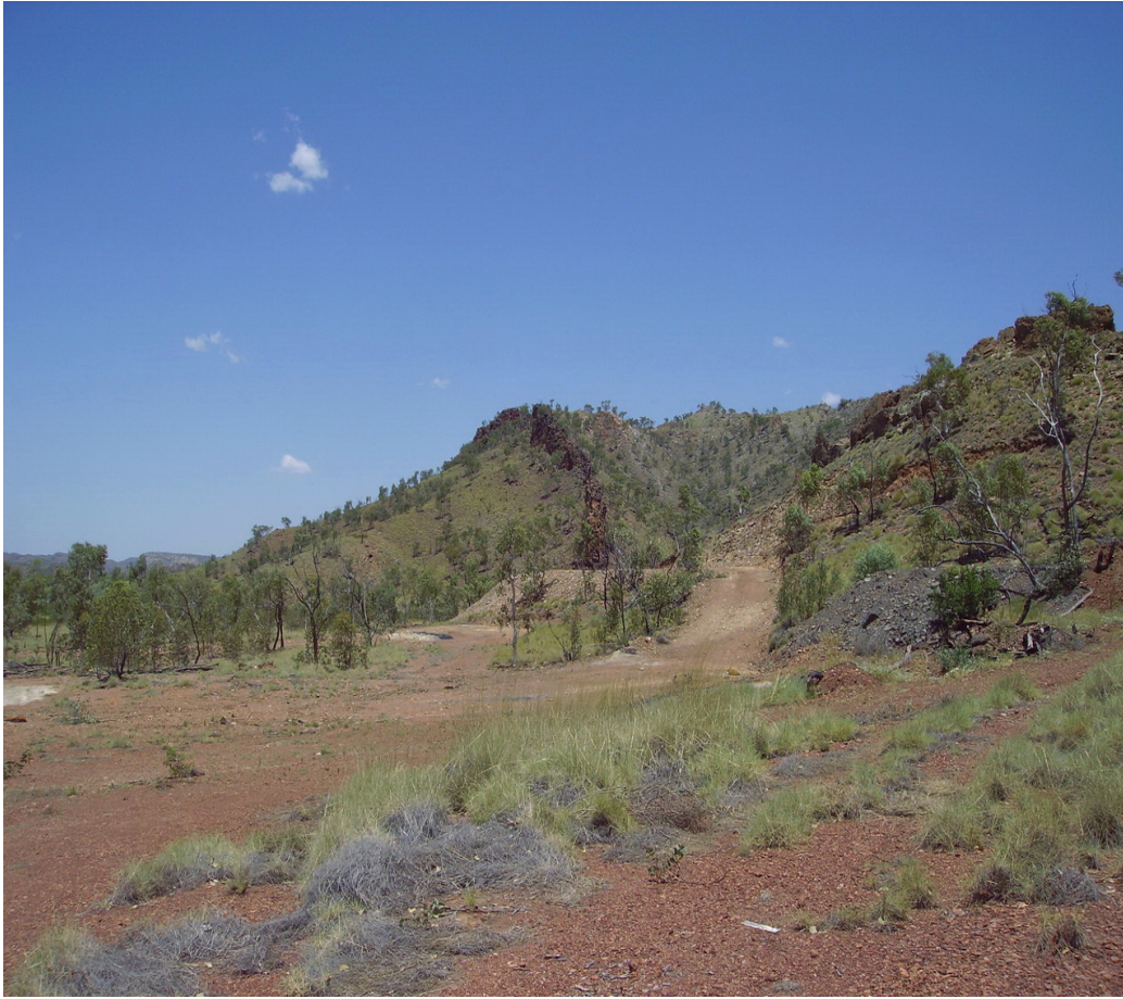
Figure 4. Sierra Line uranium anomalous ironstone ridge – 350 ppm U_3O_8 . Copper workings in foreground.

The latest assay results together with the results of the previous helicopter supported geological mapping and sampling programme continues to identify priority drill targets for 2008 in ground held by Matrix Metals. These results are subject to the NW Queensland Joint Venture.