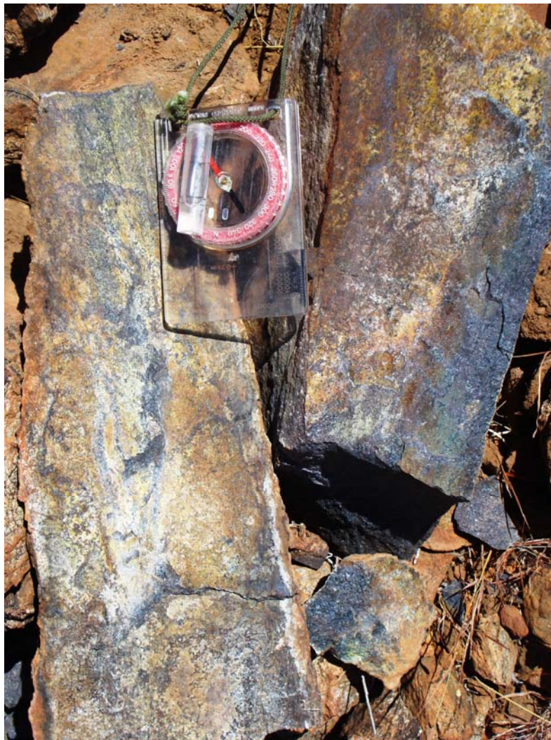
Figure 3. Uranium mineralisation yellow-green uranophane within felsite at Anomaly H078 – 1.13% U_3O_8