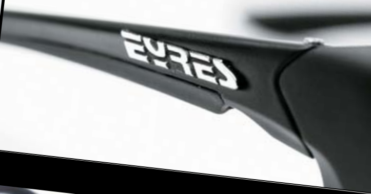
Double injected non-slip temples