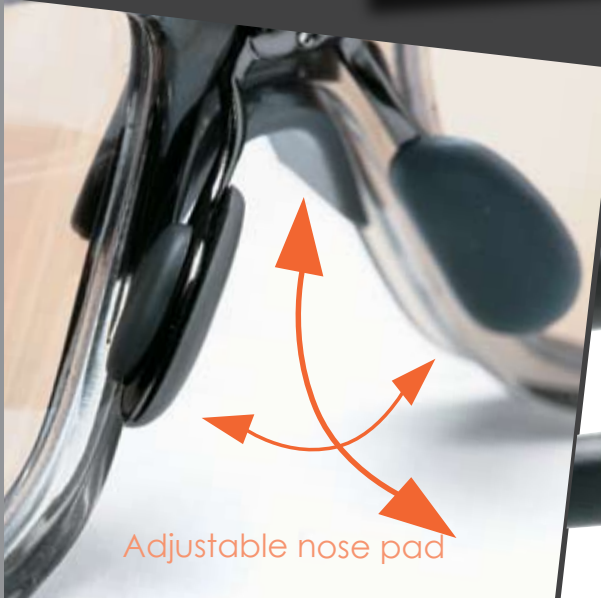
Adjustable nose pad