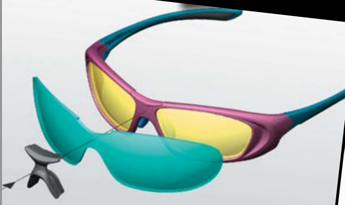
Easy Clip System