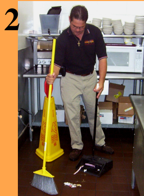
2. Thoroughly sweep all debris from floor surface and remove.