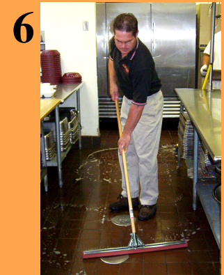
6. Squeegee water down drain and allow floor to dry.