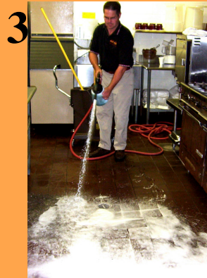
3. Fill foam gun with Sure Grip Traction enhancing daily cleaner and attach gun to water hose. Liberally apply foam to all floor areas.