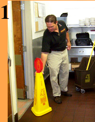
1. Always place signs in highly visible areas warning people that the floors are wet and could be slippery.