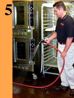
5. Rinse floor with hot water.