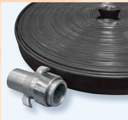
Compact and Flexible

The Waterlord A series hose has been specifically designed to remain flexible on low pressure linear irrigators. While it will still perform superbly on travelling irrigators generally, the specific low kink requirement, as needed by low pressure linear machines, is an added feature.