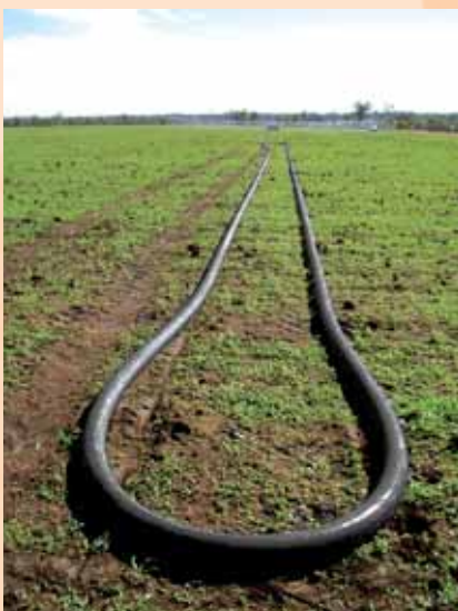
Tight bend radius