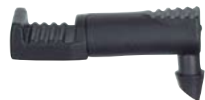
Midi Drip™ Barb 4 mm