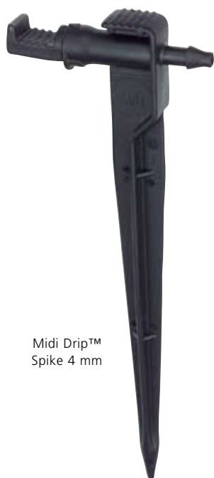
Midi Drip™ Spike 4 mm

Shrubs and flowers, fruit trees, vines and tomatoes in a wide range of situations from home gardens to large scale nurseries.