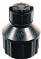
Mini Bubbler Thread 1/2"