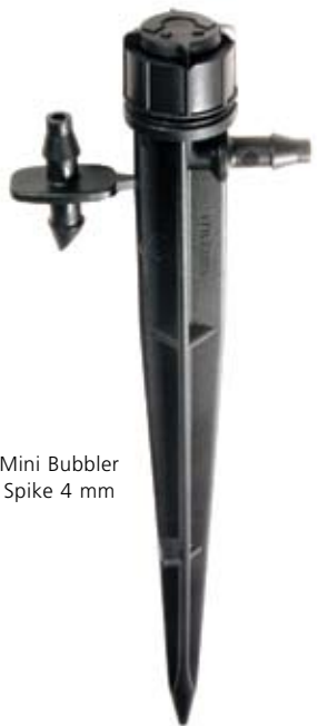
Mini Bubbler Spike 4 mm