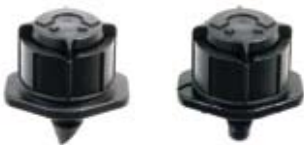
Mini Bubbler Barb 4 mm