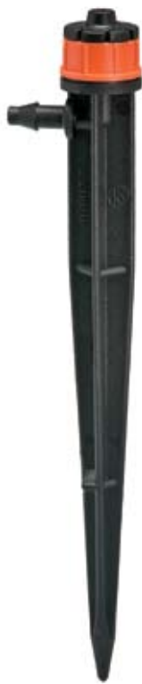
Shrubbler® 360° PC Spike 4 mm