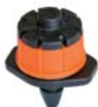
Shrubbler® 360° PC Barb 4 mm

Pots, planter boxes, balcony, patio and landscape applications.